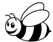
Be ready to learn

Our Learning Log this half term is helping us to develop the below value: